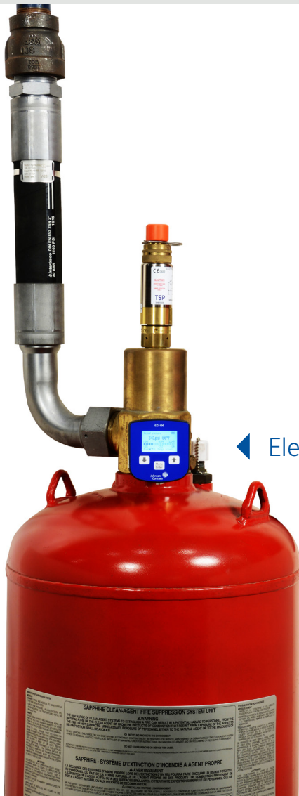
← Electronic Gauge

Backward compatible for field retrofits on most existing systems