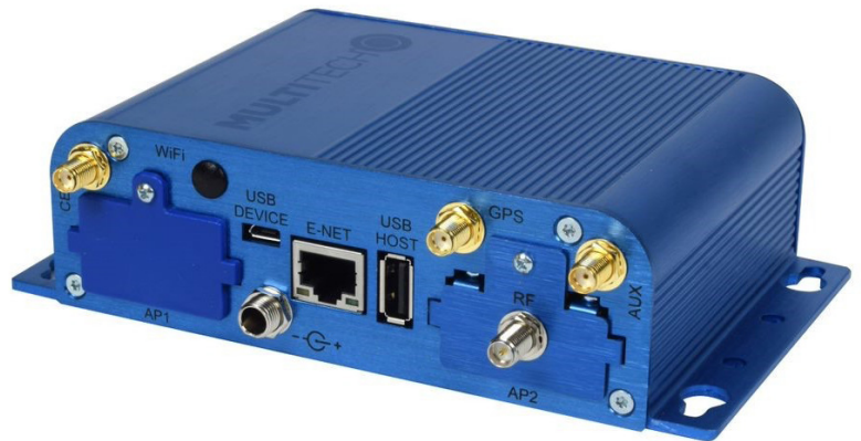
▲ Communication Gateway