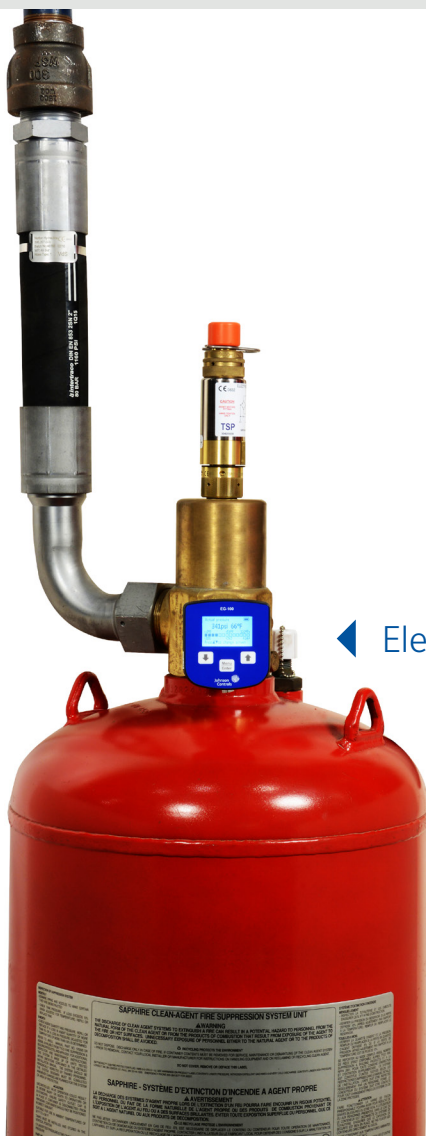
◀ Electronic Gauge

Backward compatible for field retrofits on most existing systems